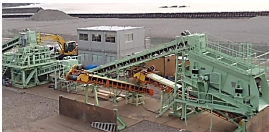
Treatment facility of tsunami deposit in Kamaishi city, Iwate prefecture (Installed on March, 2013)