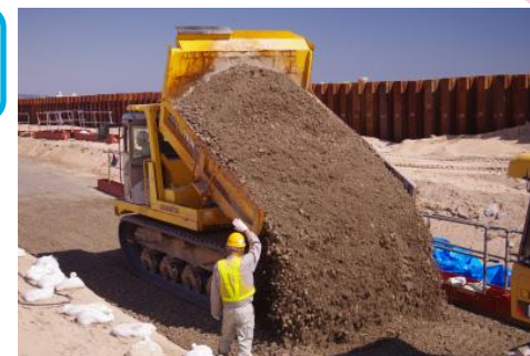
Coastal embankment restoration project in Iwaki city (Started on March 15, 2013)

Major public works using recycled material from debris