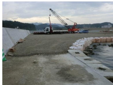
Shizugawa fishing port south-side breakwater restoration work